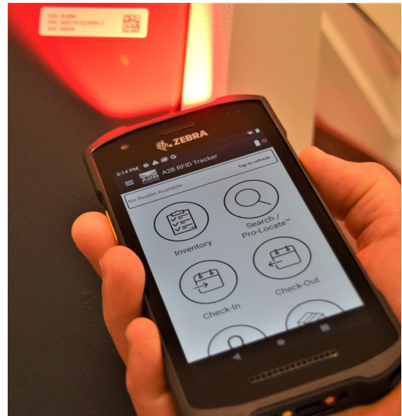
Perform inventories accurately and quickly with the A2B RFID Tracker app by scanning barcodes to capture and reconcile data and asset events.

Perform fast and accurate inventories/cycle counts with barcode, as well as, mobile and fixed RFID. Save significant time and improve the visibility of your critical assets, equipment and stock.